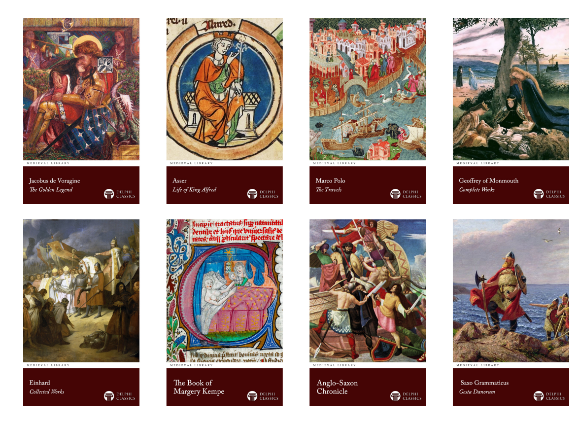
Browse the Medieval Library so far...