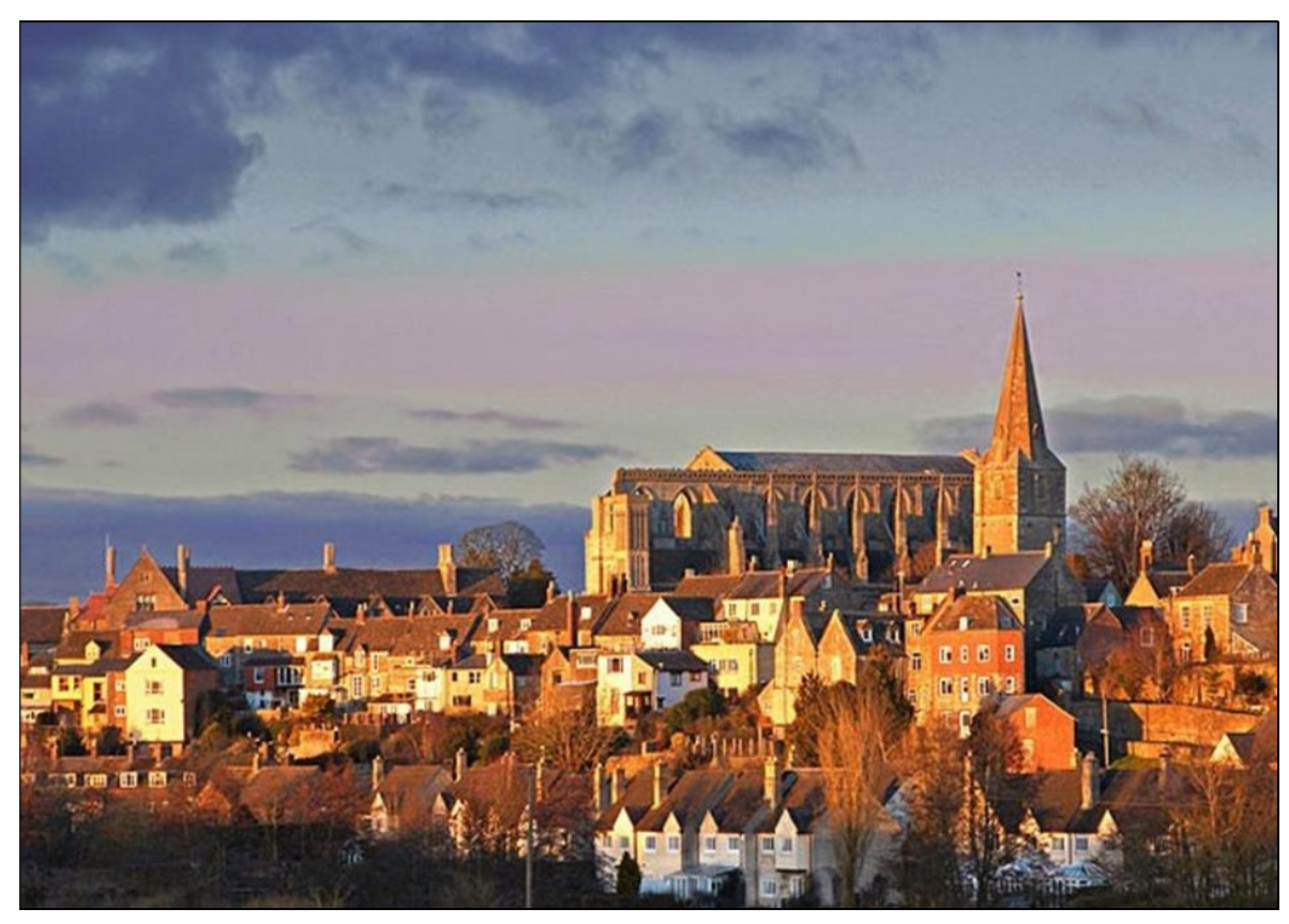
{\it Malmesbury, a town in north Wiltshire-William's birthplace}