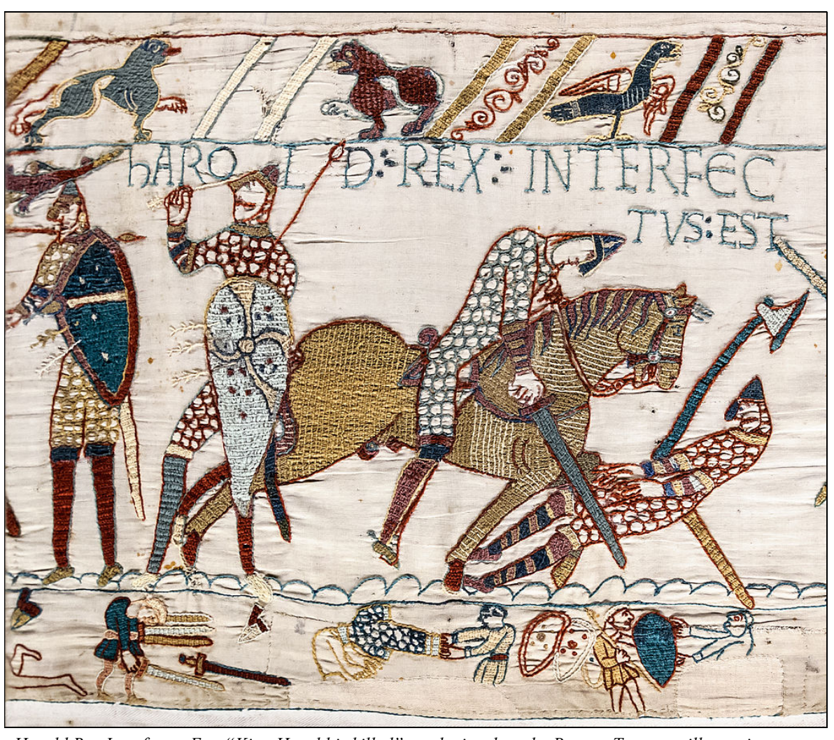
Harold Rex Interfectus Est: "King Harold is killed", as depicted on the Bayeux Tapestry, illustrating the Battle of Hastings in 1066 — a key event of William's 'Chronicles'.