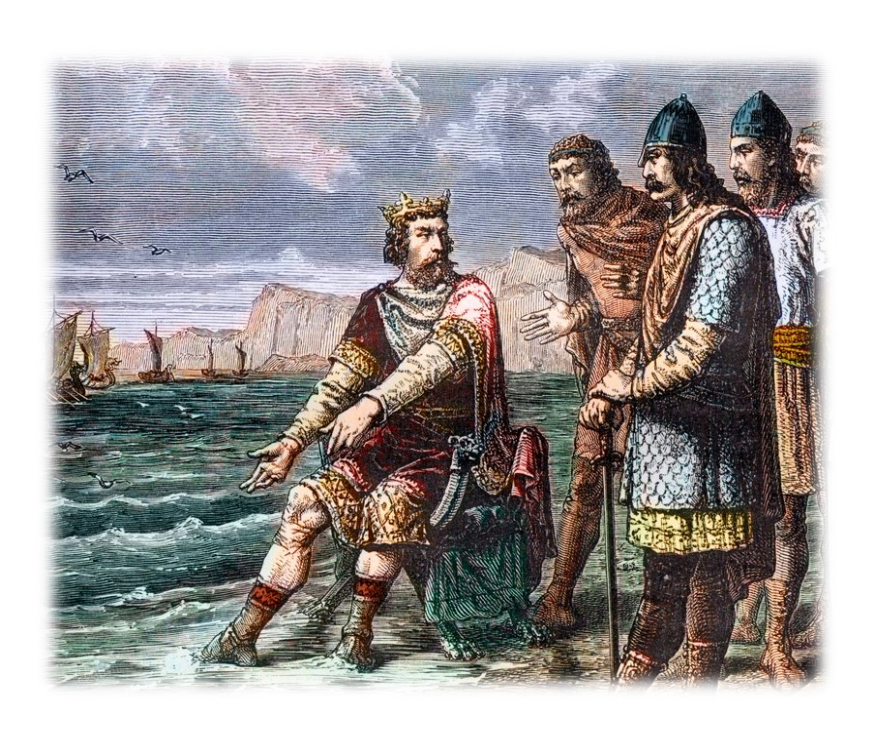
By Delphi Classics, 2024