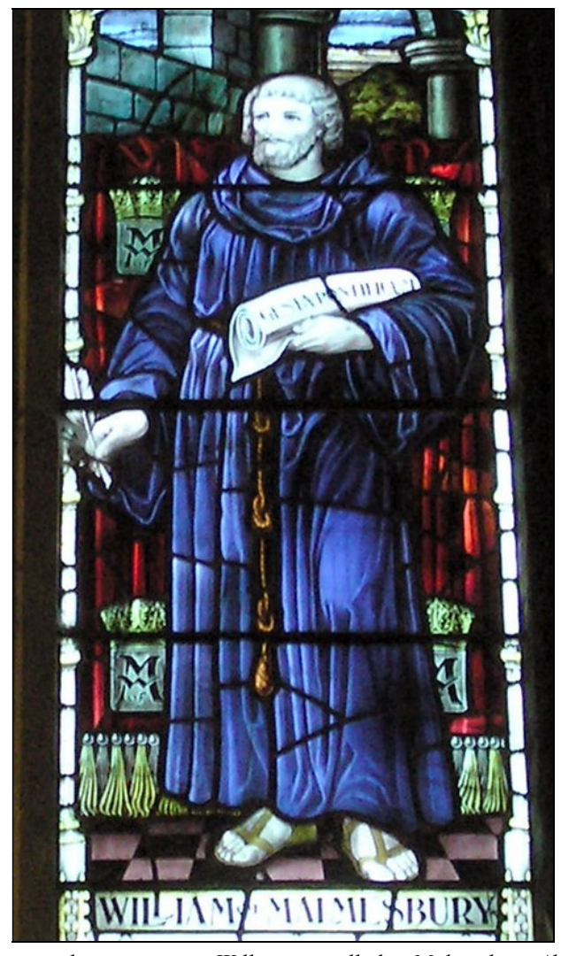
{\it Stained-glass\ window\ portraying\ William,\ installed\ in\ Malmesbury\ Abbey\ in\ 1928}